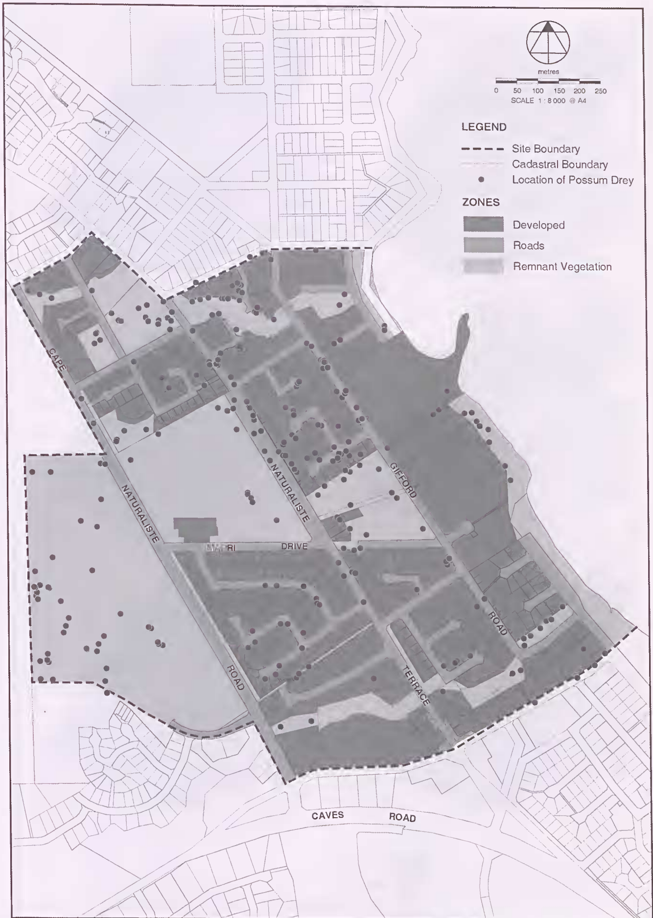
Figure 1. Locations of Pseudocheirus occidentalis dreys in the Dunsborough town site.